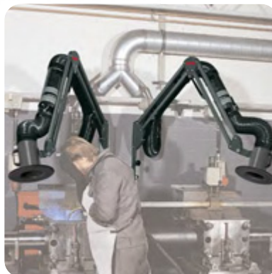
Extraction arm at a welding station