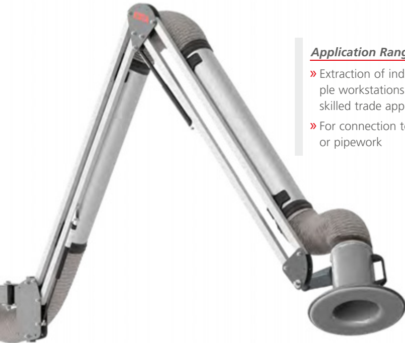
Extraction arm with flanged hood