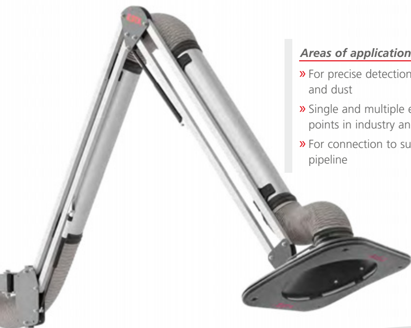
Suction arm with efficiency hood