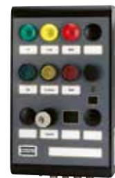
Operator panel Basic