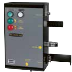
Tool Control Box (TCB)